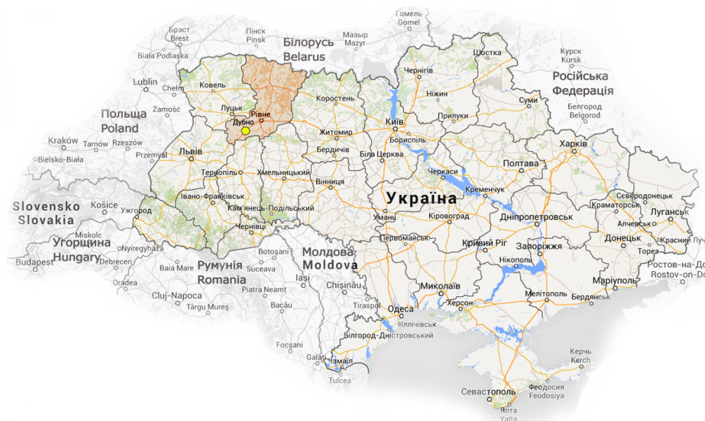
Fig. 1 The city on the map of Ukraine

There are trends of reducing the number of working-age population related to the increase of its migration abroad. Namely this is Poland, Slovakia, which have a high demand for labor and higher wages. The share of the working-age population decreased from 62.1% to 61.3% during 2012-2016. The negative trend is the aging of population. Thus, the share of the people over the working age has increased from 18.1% to 18.8% for the period of 2012-2016.